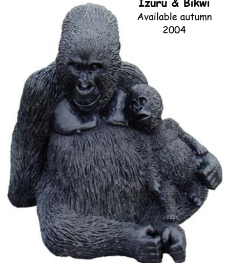
Izuru & Bikwi Available autumn 2004

In autumn we are launching a new large piece which should be available in time for Christmas 2004. This piece depicts a mother and young from the