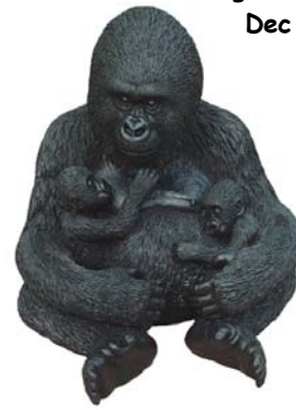
G004 Ijicho & Infants